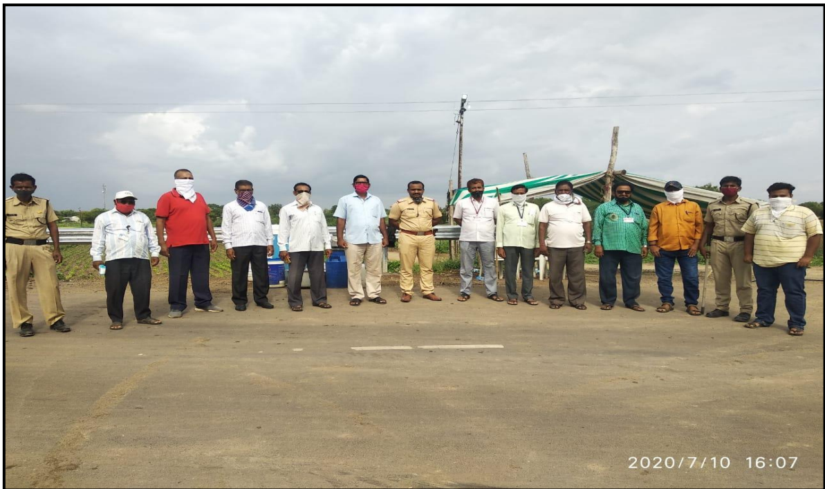
Check Post Duty during Covid 10.07.2020