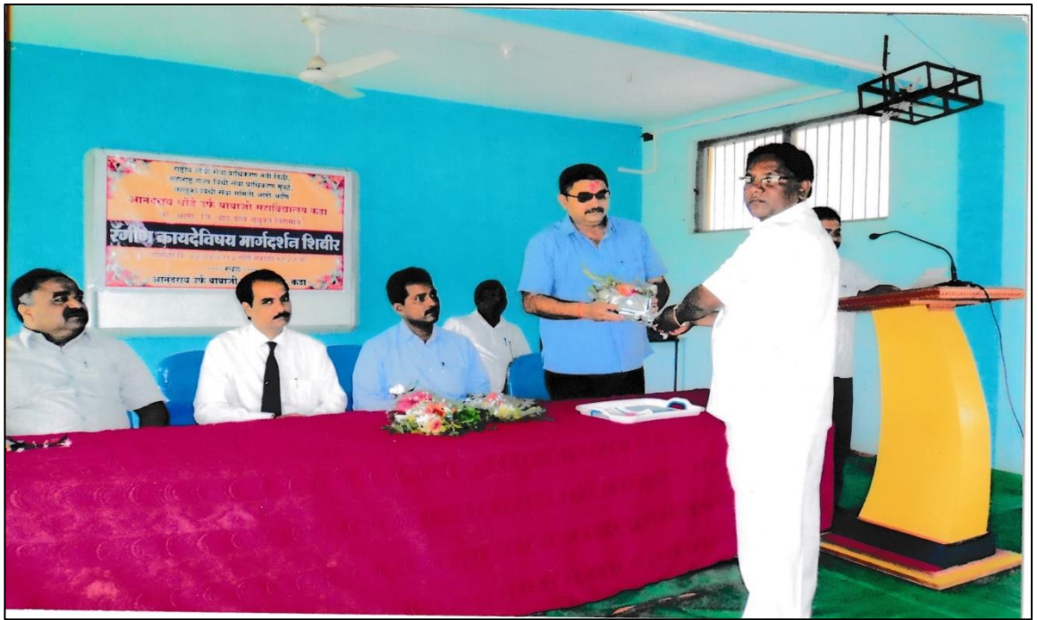
Awareness about Ragging Law Camps arranged in College – 2018